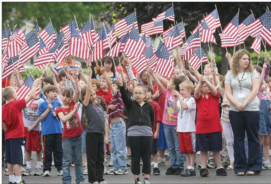
Teachers and students at Skoi-Yase Elementary School in Waterloo gathered by the front flagpole Tuesday to honor several local veterans on Flag Day.